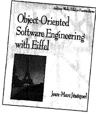
In this up-to-date guide, Jézéquel provides full coverage of the most recent version of the language, focusing on Eiffel's practical use in the development of large, missioncritical software systems.