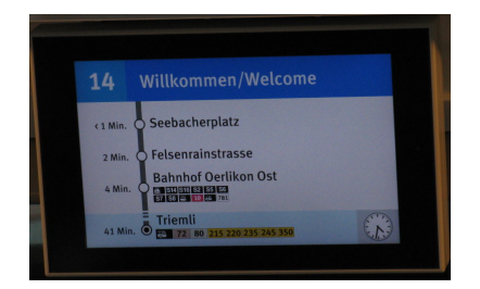
Figure 1: Route information display in a tram

In this task you will equip public transportation in Traffic with route information displays, similar to the ones real trams and buses have in Zurich (Figure 1).