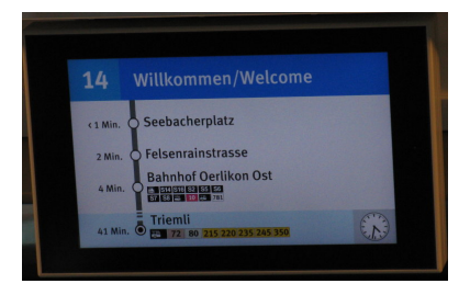
Figure 1: Route information display in a tram

In this task you will equip public transportation in Traffic with route information displays, similar to the ones real trams and buses have in Zurich (Figure 1).